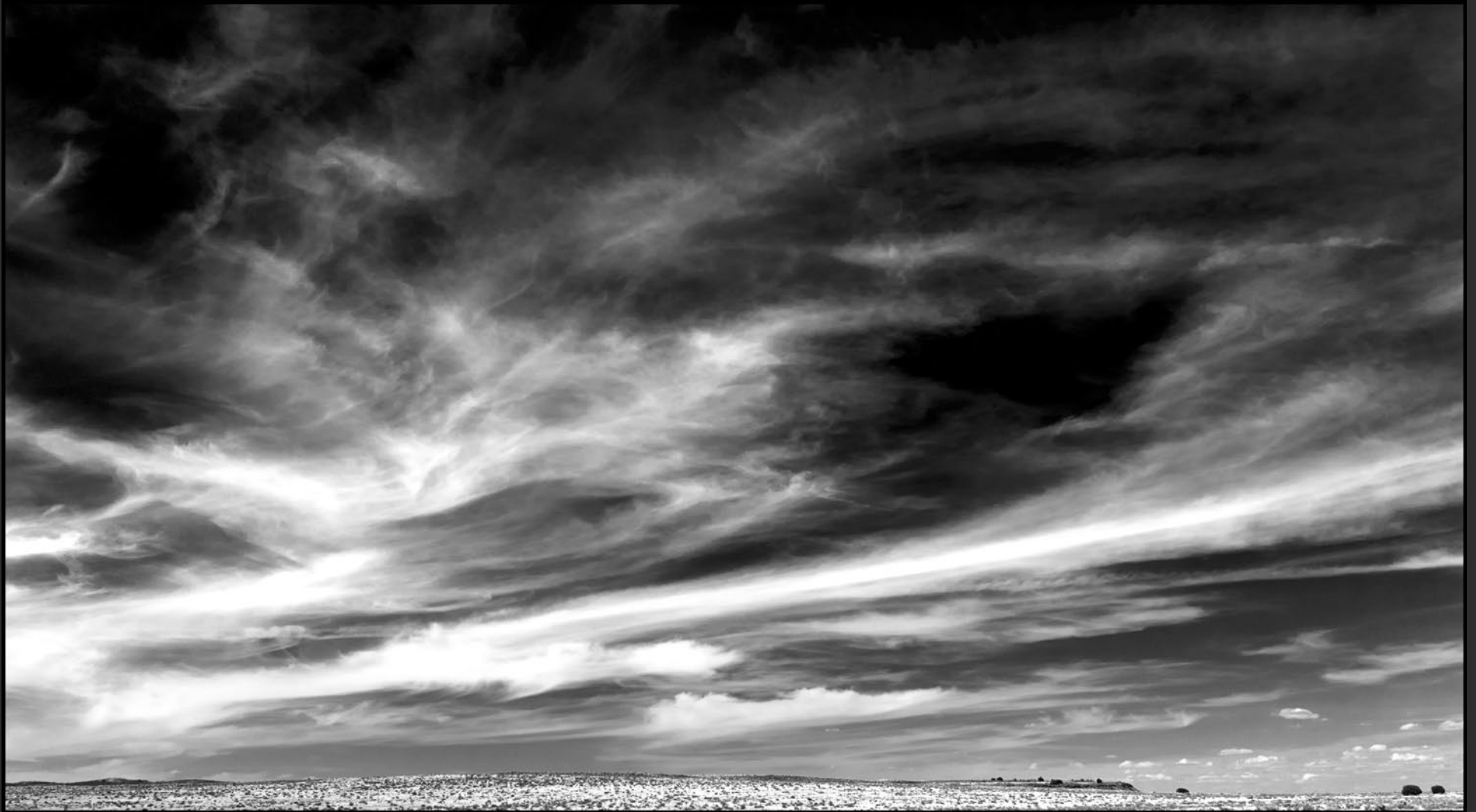
Landscape Painted Desert — Holbrook Arizona