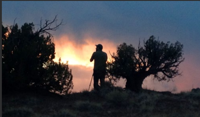
Photographing Sunset — Ghost Ranch