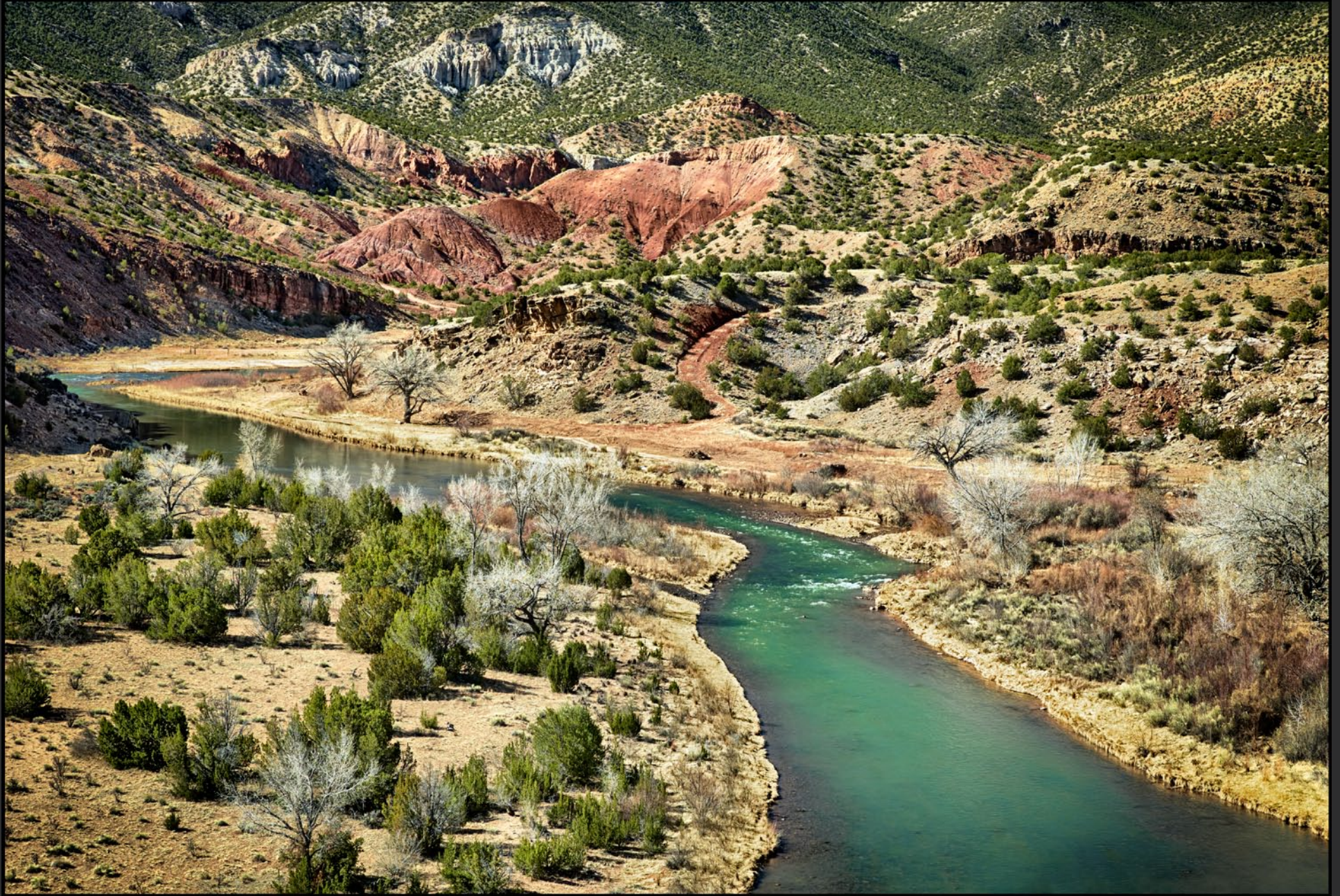
Rio de Chama — Abiquiu New Mexico