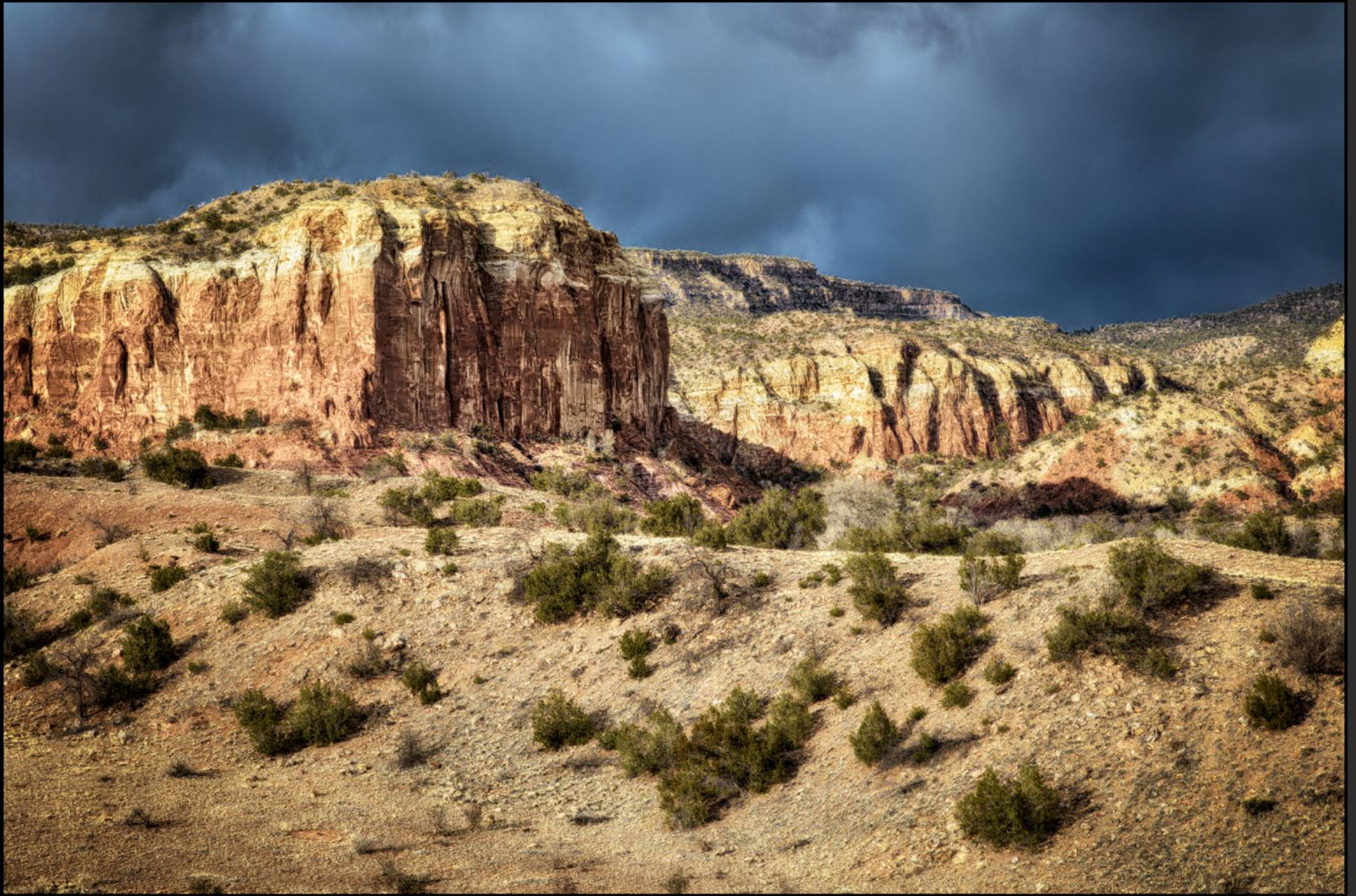
Kitchen Mesa Ghost Ranch — Abiquiu New Mexico