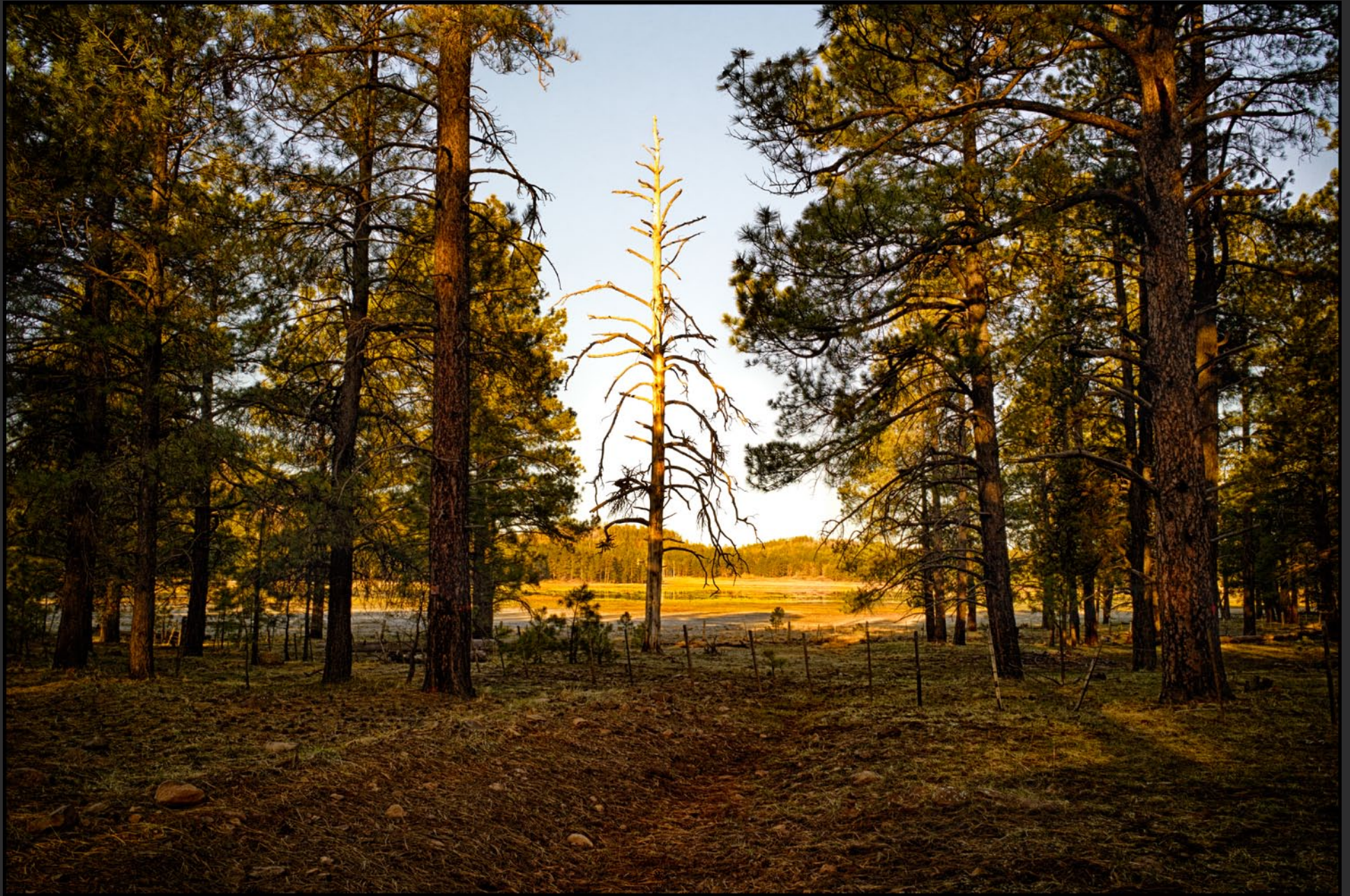
Kaibab National Forest — Williams Arizona