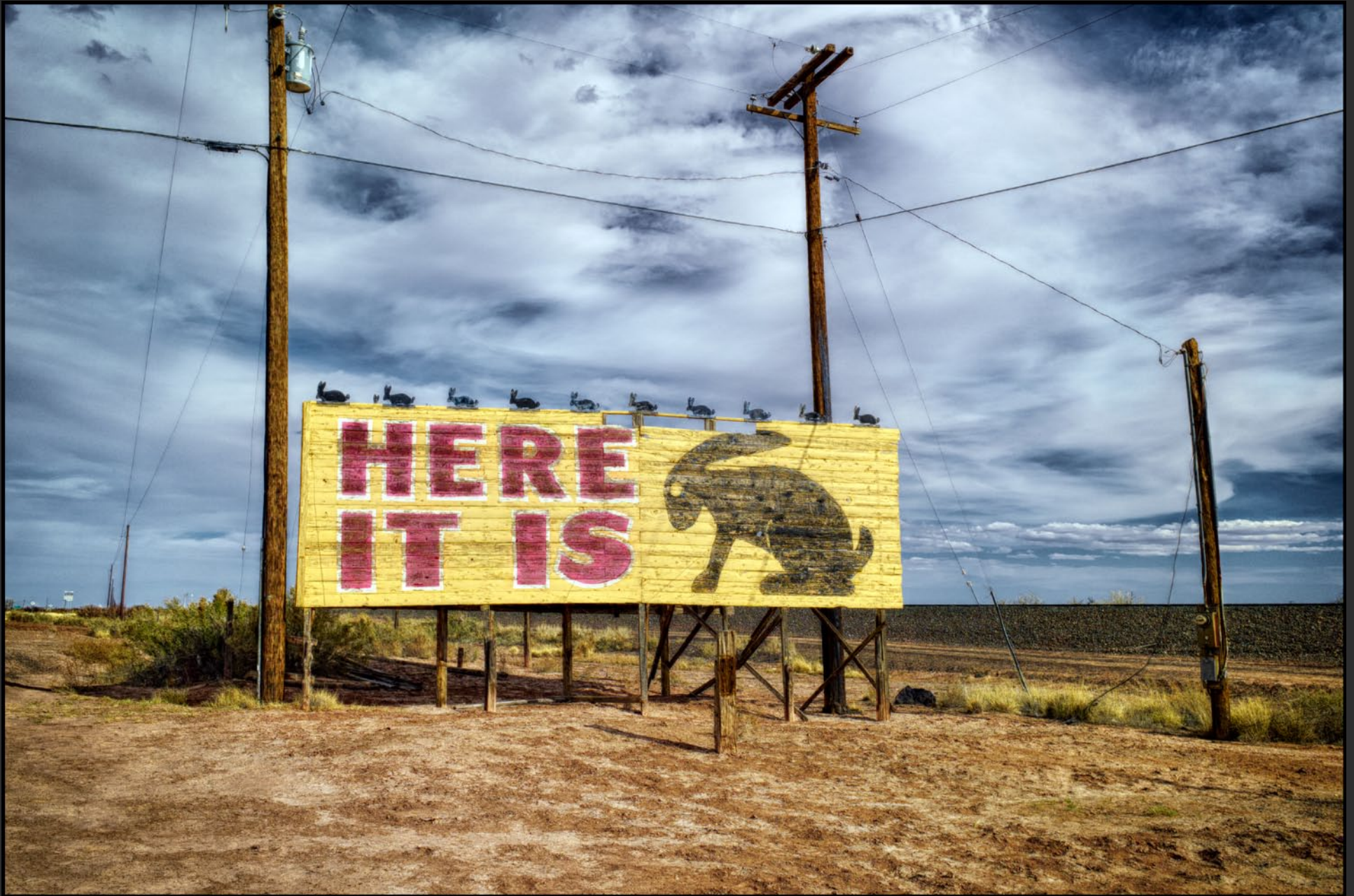
Population 8 — Jack Rabbit Arizona