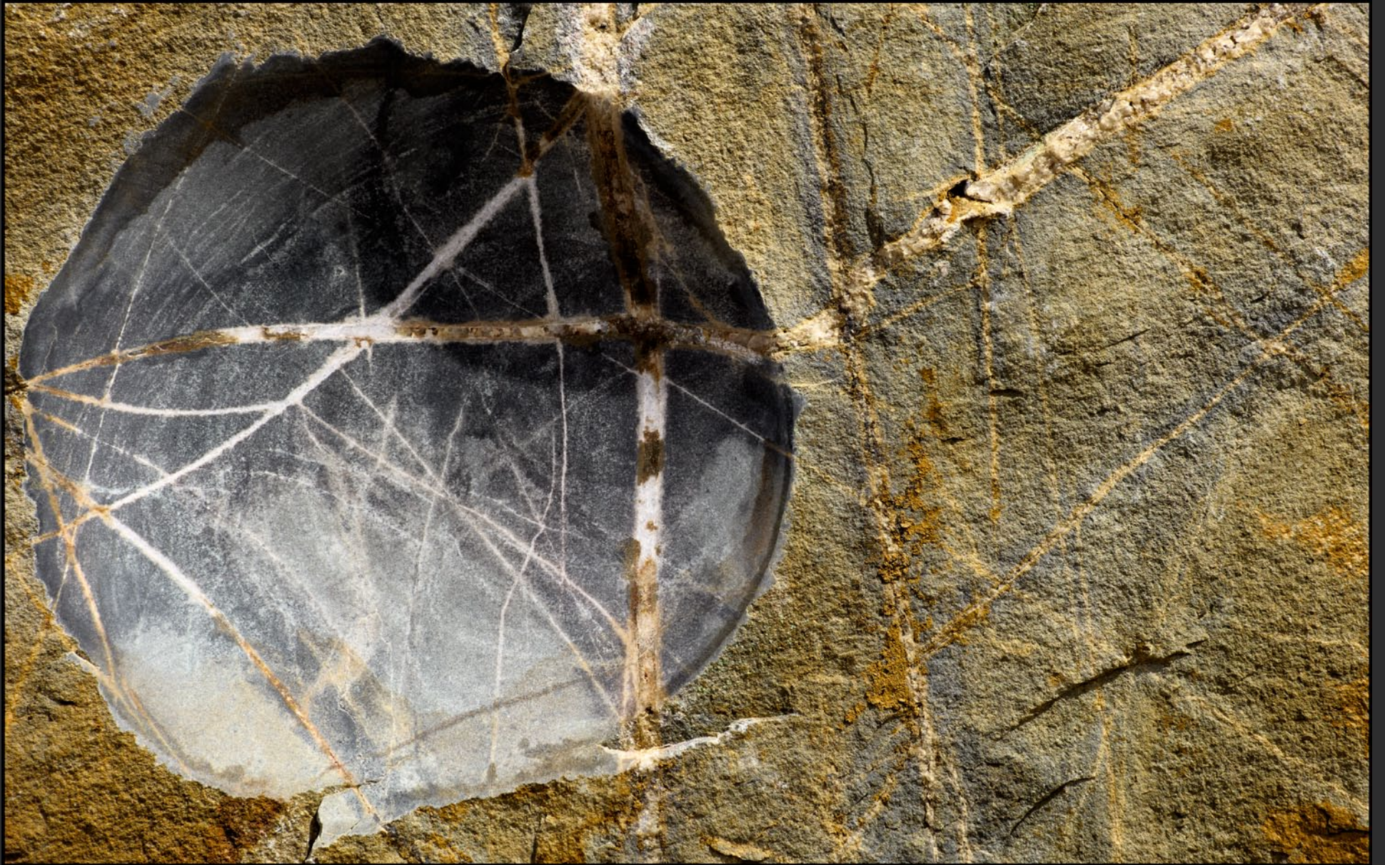
Rock Abstract — Madrid New Mexico