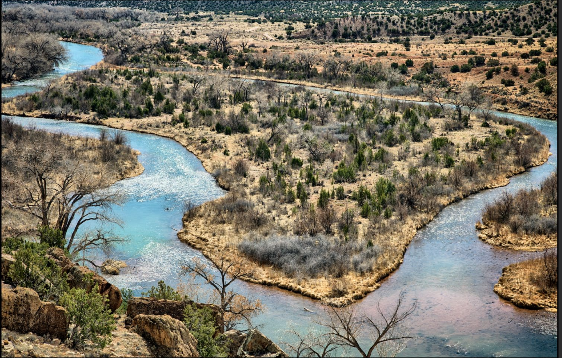
Rio de Chama Fork — Abiquiu New Mexico