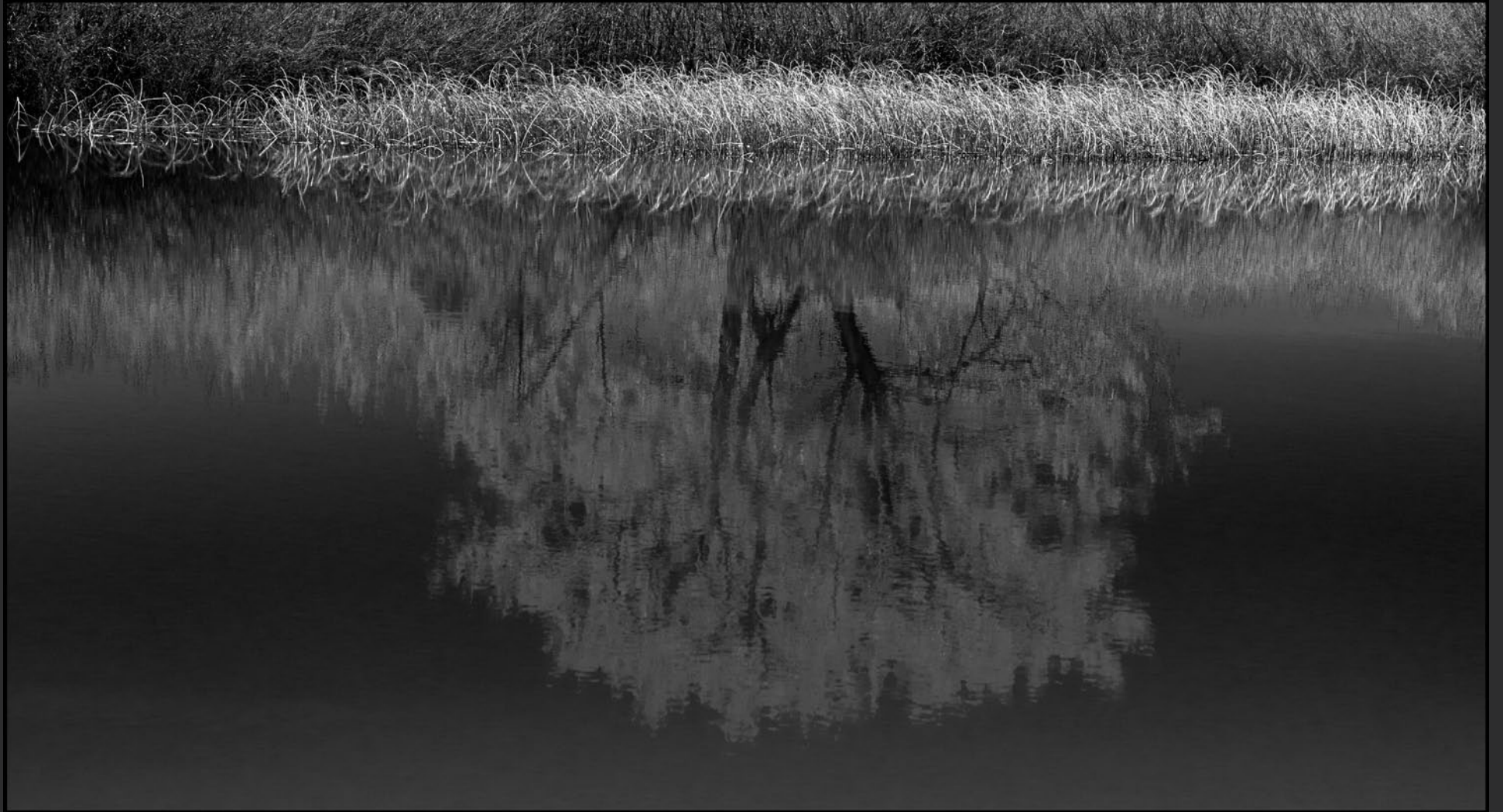
Landscape Reflection — Ghost Ranch Abiquiu New Mexico