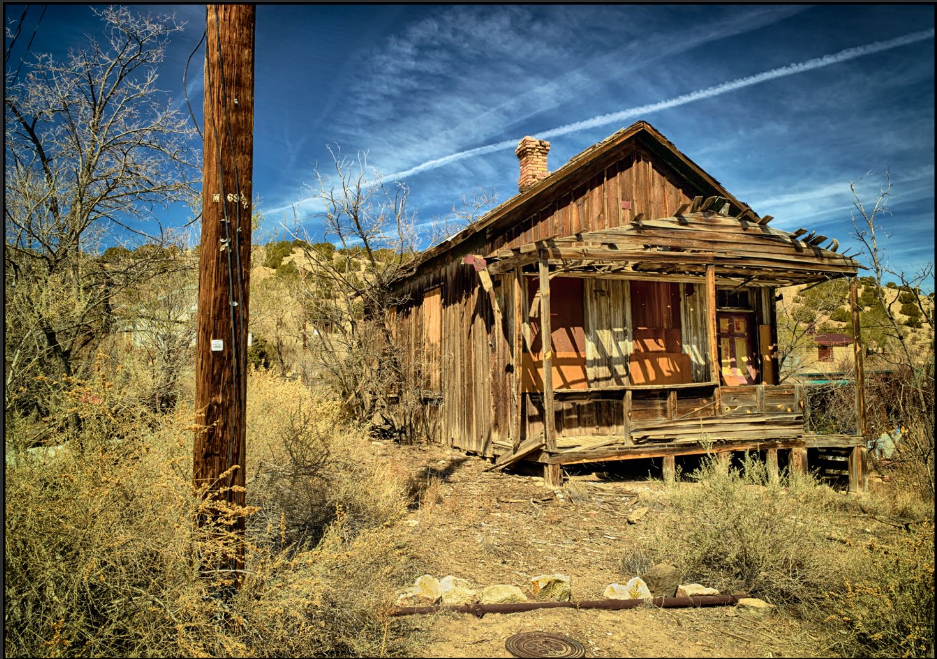
Abandoned Shack — Madrid New Mexico