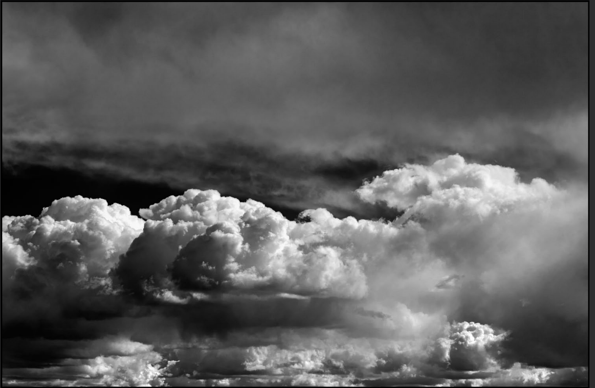
Clouds — Santa Fe New Mexico