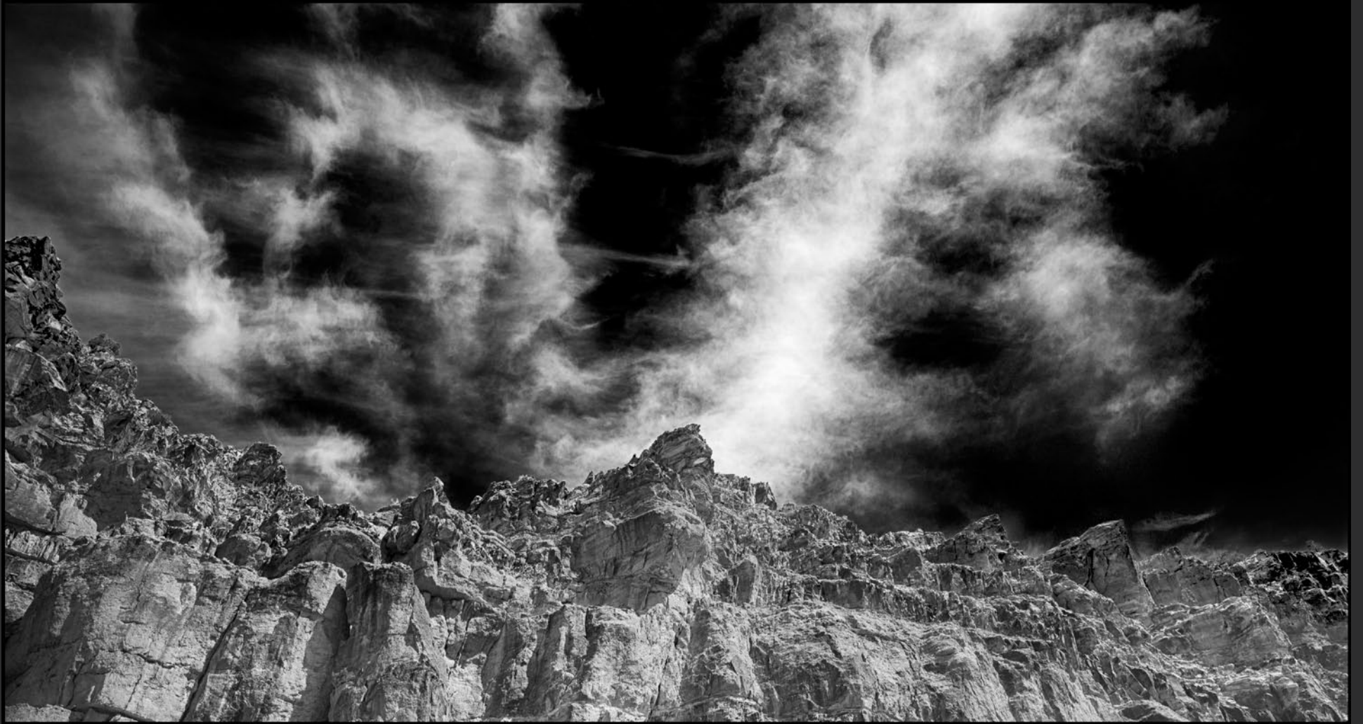
Clouds Over Mesa — Abiquiu New Mexico