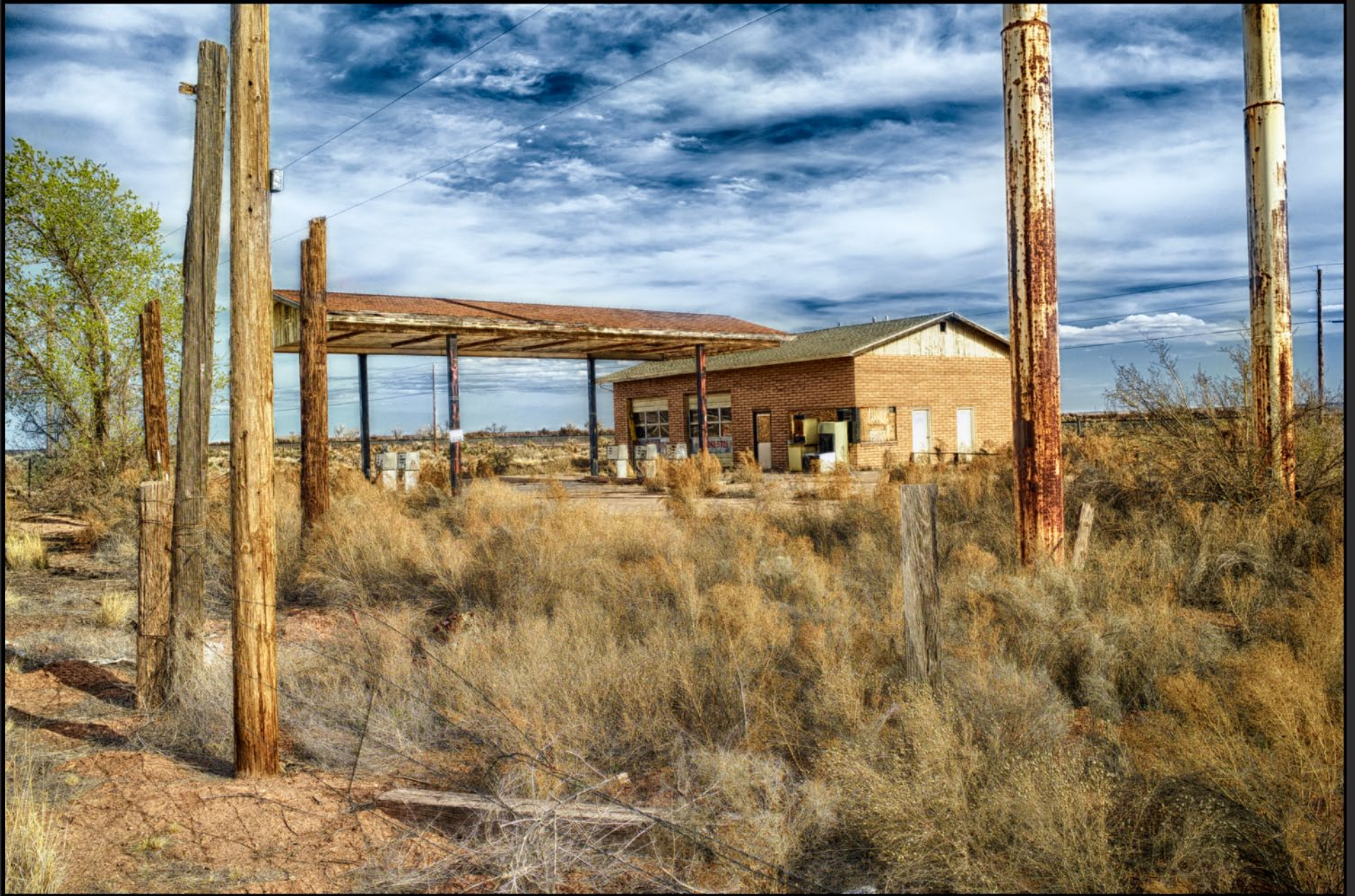
Abandoned Filling Station — Jack Rabbit Arizona